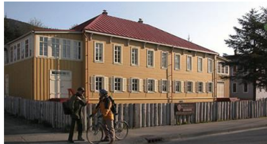
South elevation after restoration.