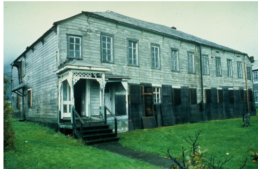
Southeast view of Russian Bishop's House in 1975 prior to restoration project.