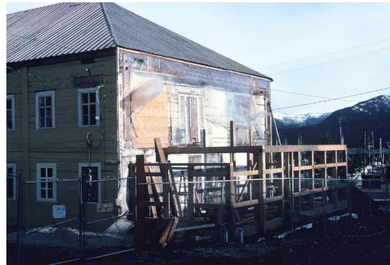
East Gallery heavy timber restoration construction underway.