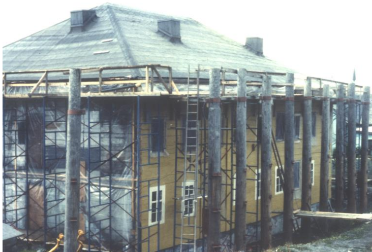
Russian Bishop's house with structural support system in place.